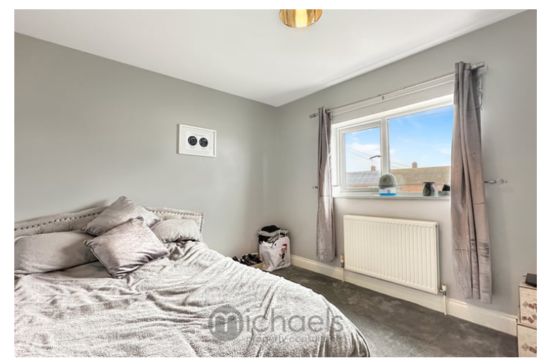
10' 6" \times 9' 6" (3.20m \times 2.90m) UPVC window to front aspect, radiator.