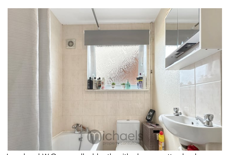
Low level W.C, panelled bath with shower attached, radiator, vanity wash basin.