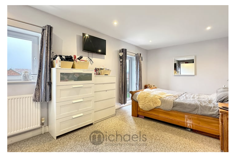
19'\ 2''\ x\ 9'\ 9''\ (5.84m\ x\ 2.97m) UPVC window to rear aspect, Juliette balcony to rear, radiator, spot lights, space for wardrobes.