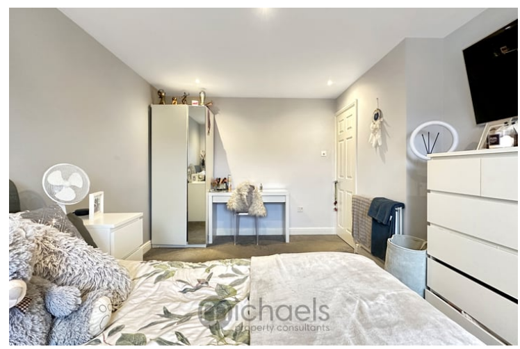
14' 9" x 10' 4" (4.50m x 3.15m) UPVC window to front aspect, inset storage cupboard, radiator.