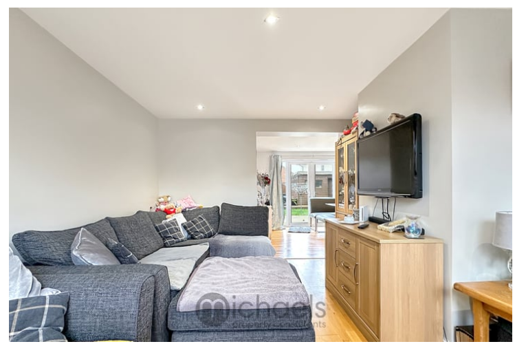
15' 4" \times 10' 4" (4.67m \times 3.15m) UPVC window to front aspect, radiator, spot lighting, access into: