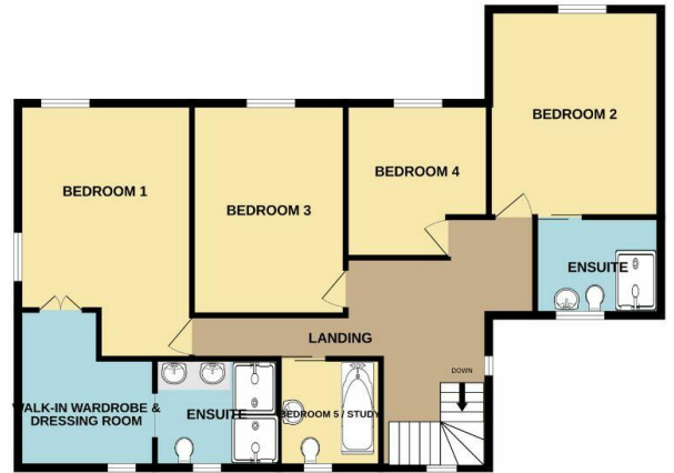
1ST FLOOR 1040 sq.ft. (96.6 sq.m.) approx.