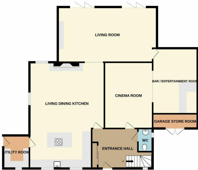
GROUND FLOOR 1546 sq.ft. (143.6 sq.m.) approx.