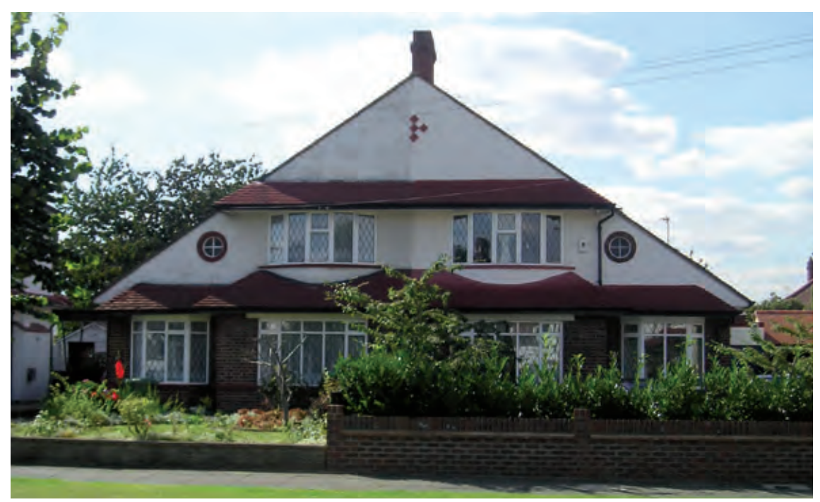
This pair of chalet style semi-detached houses is relatively unaltered externally and retains original features such as symmetrical porthole windows, first floor bowed five light windows and central chimney stack. The low wall on the right is original. Front doors are on the side of the building.