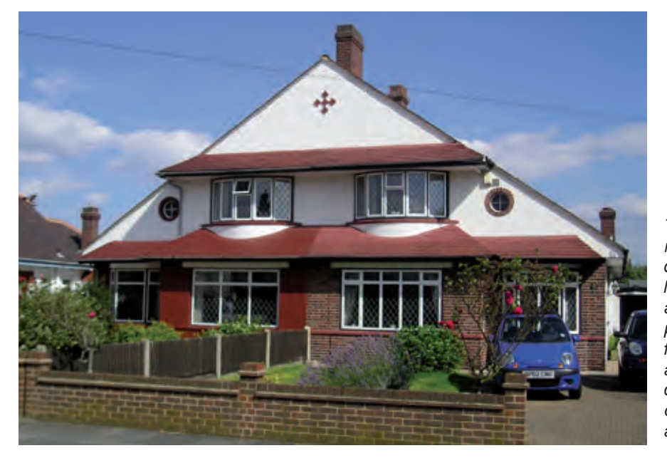
The house on the right retains much original detail but the one on the left has painted brick and a different glazing pattern to the ground floor windows. Minor alterations such as these can spoil a building's distinctive 1930s appearance.