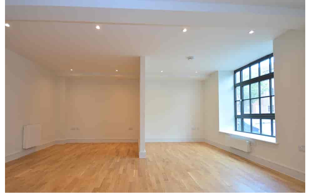
Plot 15 The Barker Buildings, The Barker Buildings, Northampton NN5 7FA £140,000 - Leasehold