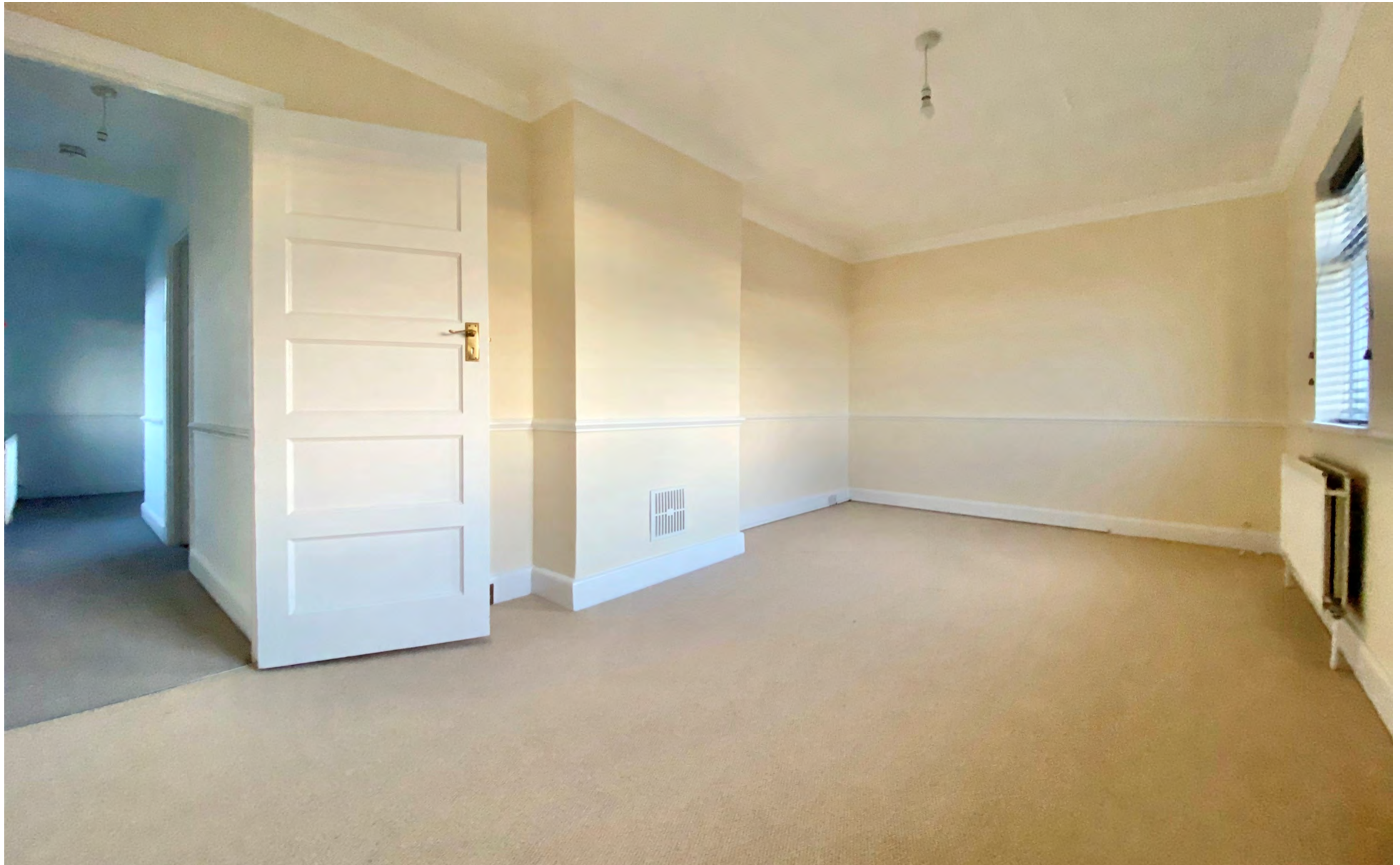
Sandbanks Road, Lilliput BH14 8HX