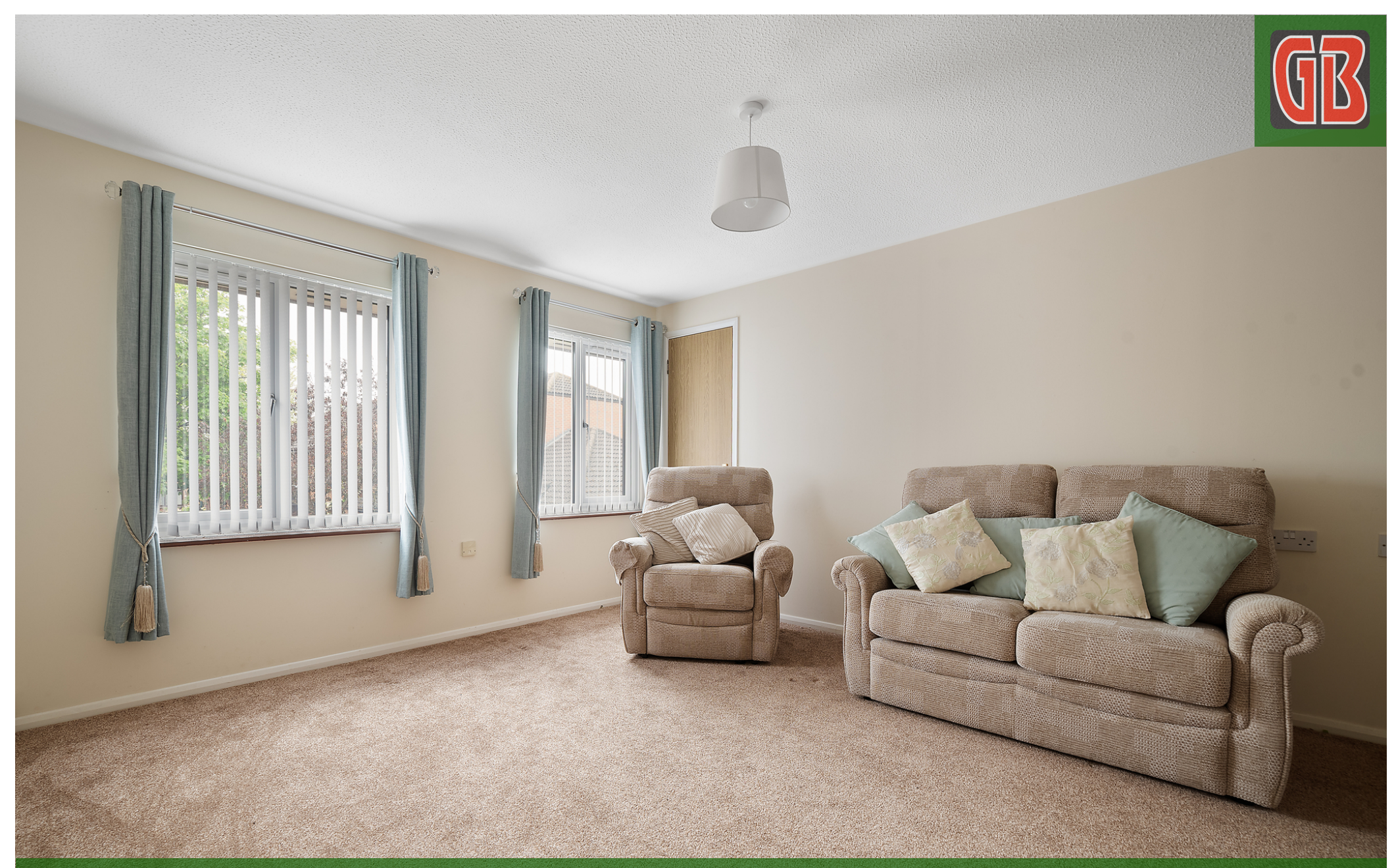
Flat 44 Berryscroft Court, Berryscroft Road, Staines-upon-Thames. TW18 1NA.

1 Bedroom Retirement Property - £125,000 Leasehold