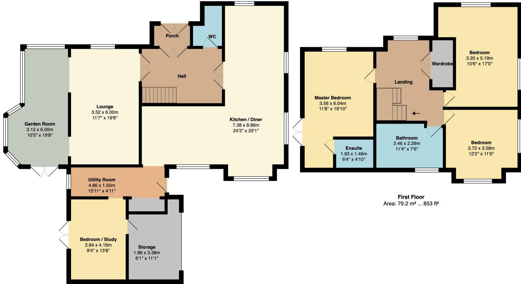
Ground Floor Area: 128.9 m 2 ... 1388 ft 2