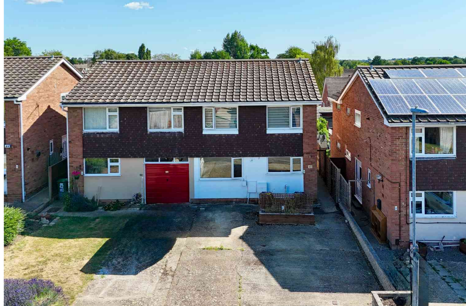
Rodney Road, Hartford PE29 1RZ