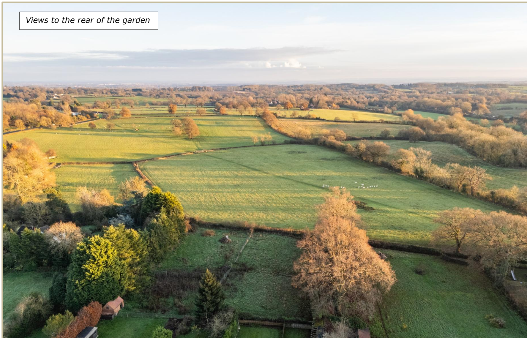
Views to the rear of the garden