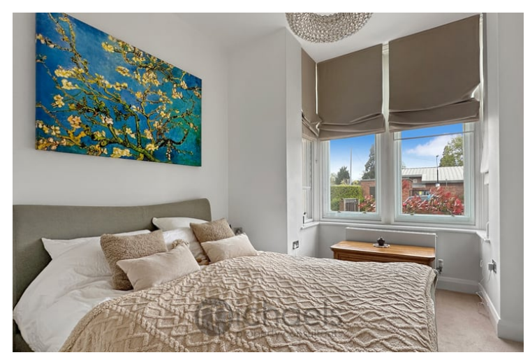
13'5" \times 11'0" (4.09m x 3.35m) Sash window to front aspect, radiator, inset built in soft close wardrobes.