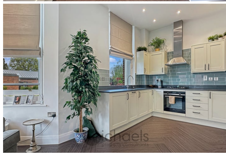
16' 9" x 14' 5" (5.11m x 4.39m) Full range of base and eye level units, work surfaces and cupboards, integrated fridge/freezer, washing machine and dishwasher, wood effect flooring, large sash windows to front and side aspects, tiled splash back, spot lighting.