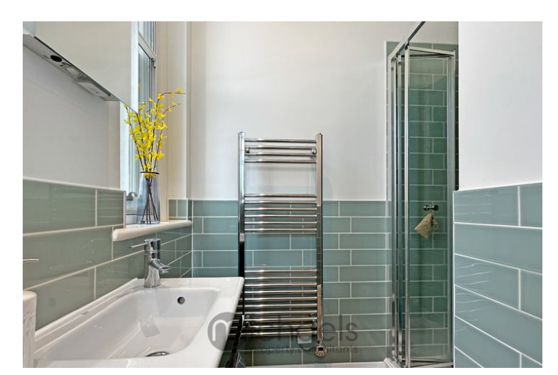
9' 2" x 6' 7" (2.79m x 2.01m) Low level W.C, vanity wash basin, half tiled walls, UPVC window to rear aspect.