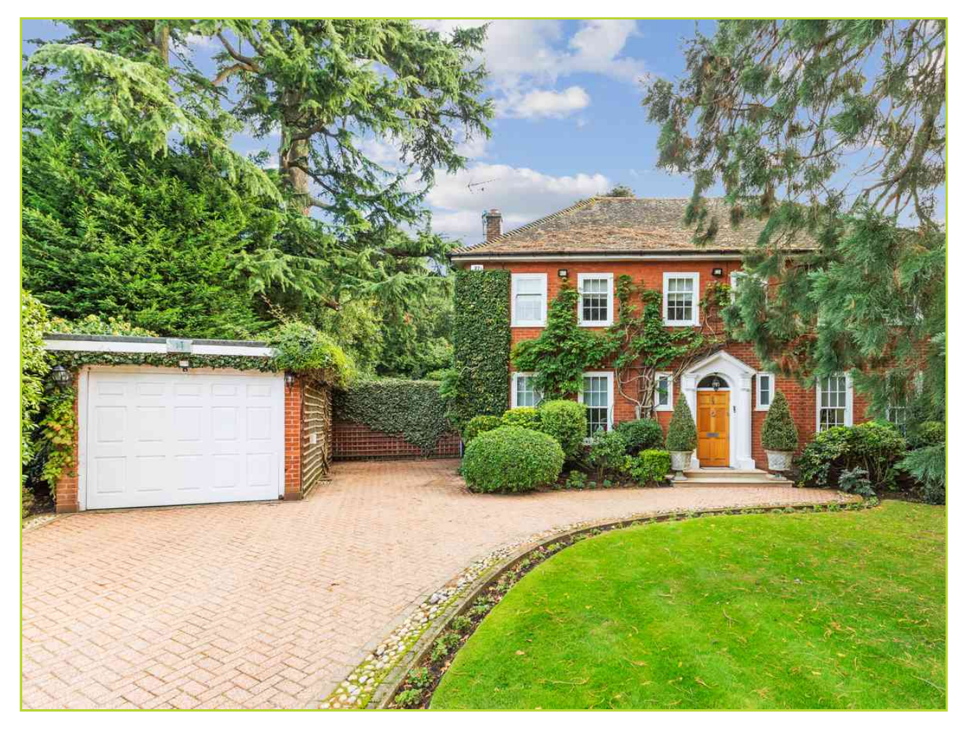
Fallowfield, Stanmore, Middlesex. HA7 3DF. £2,000,000 Freehold

A Double Fronted Detached Residence set behind a sweeping drive in a prime location off Stanmore Hill.