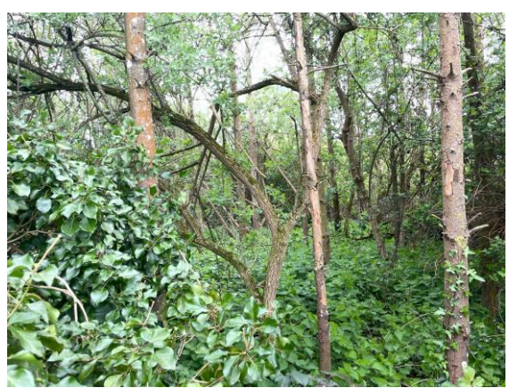
Auction Guide Price £60,000 to £80,000*

Tuesday 18<sup>th</sup> June 2024, 12pm The Theatre, The Royal Bath and West Showground, Shepton Mallet, BA4 6QN Bid remotely via Livestream, in person or by proxy.