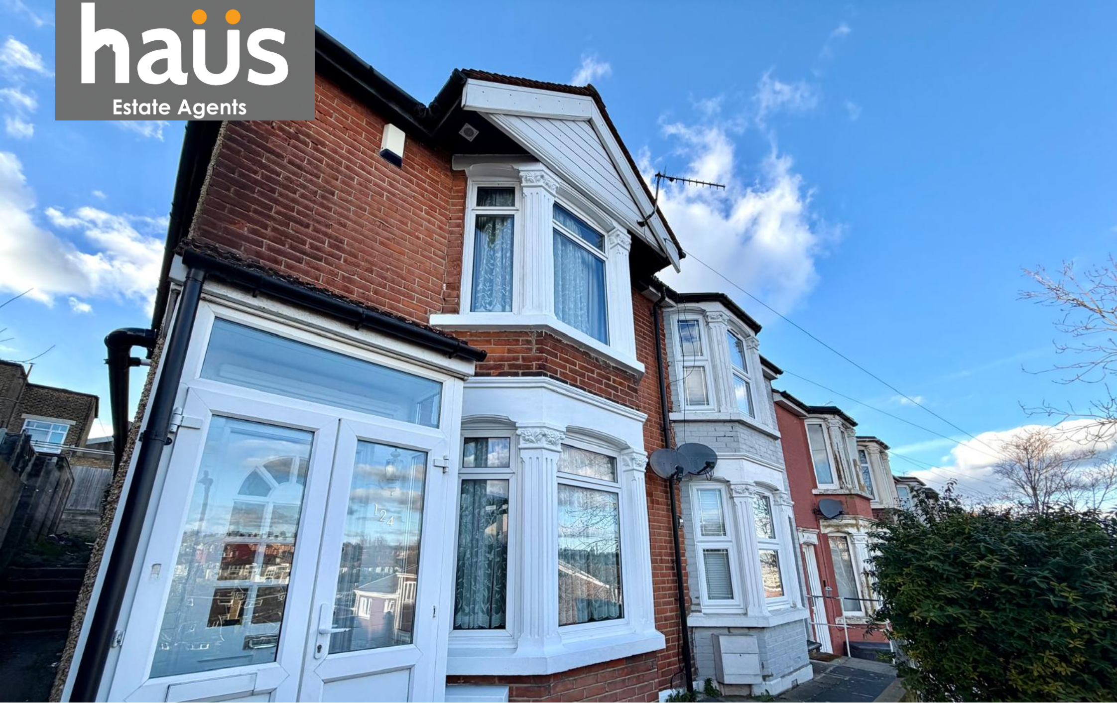
Three Bedroom Terraced House Mount Road, Chatham, Kent, ME4 5RR