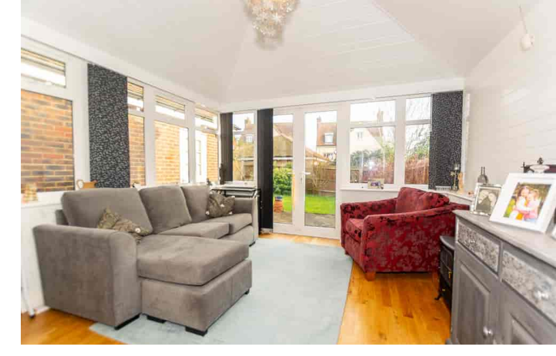
39 Wharton Drive, Beaulieu Park, Chelmsford, Essex CM1 6BF £450,000 - Freehold