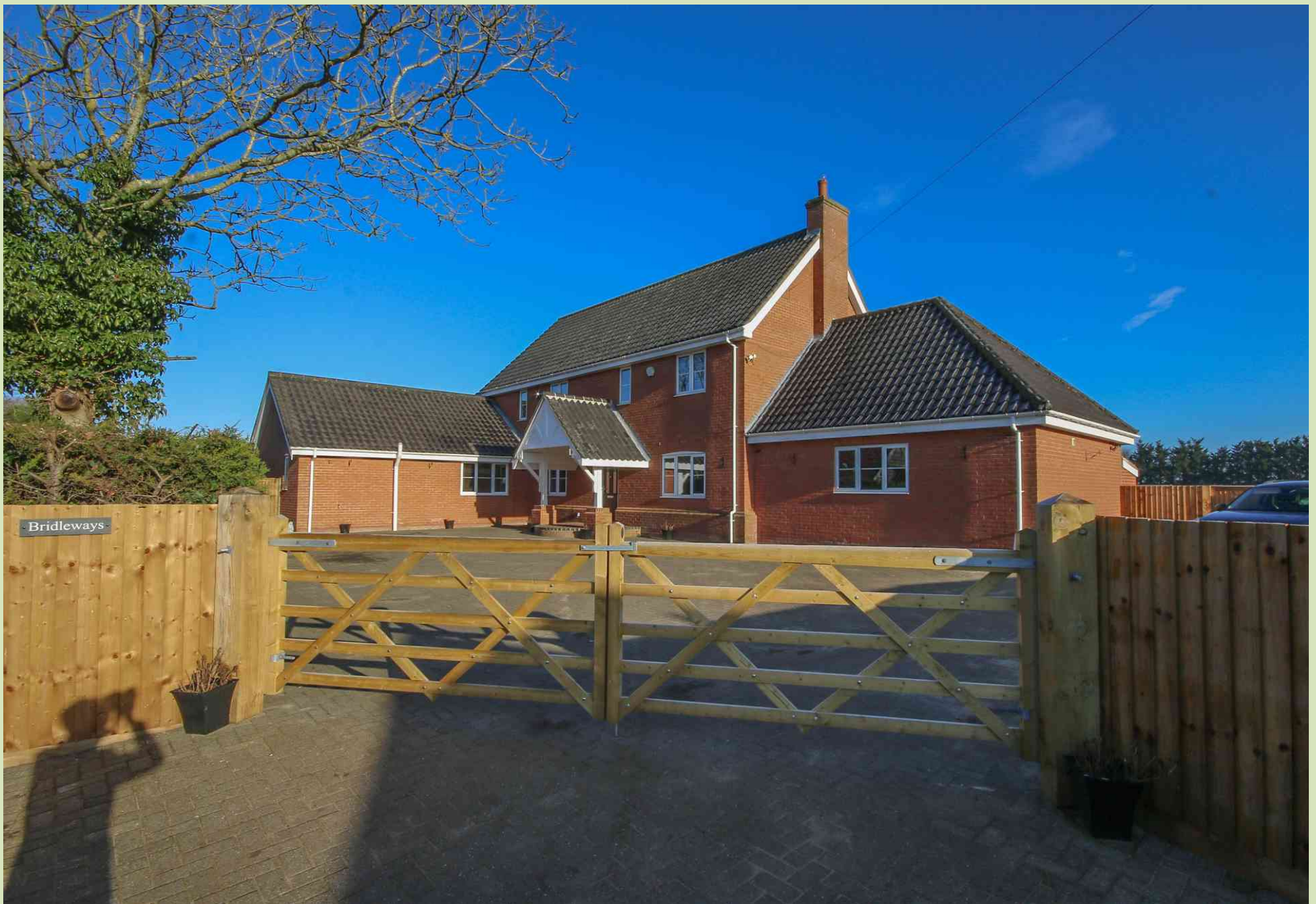
Bridleways, Shipdham Guide Price £975,000