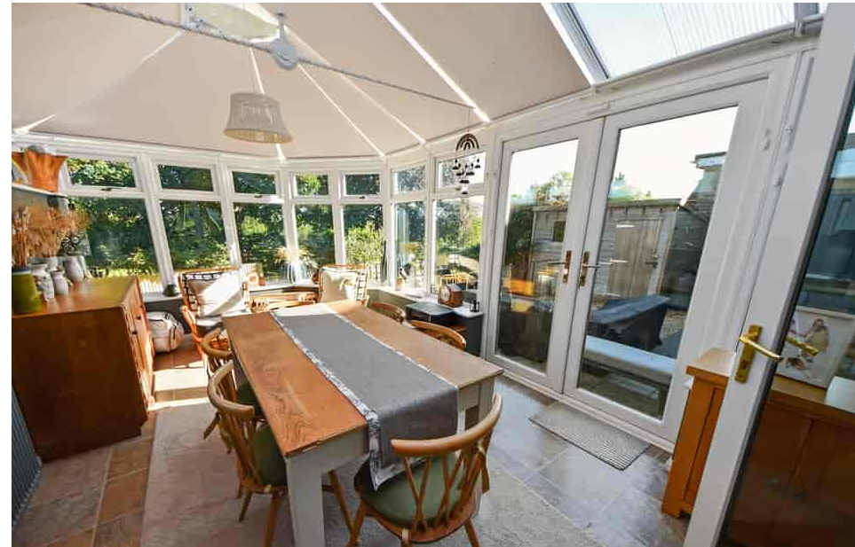
11 Robins Close, Barford St Michael, Oxfordshire. OX15 0RP Guide Price £495,000 - Freehold