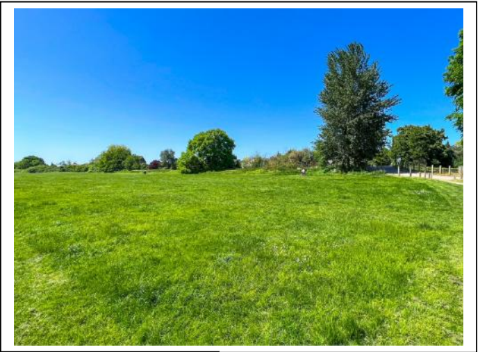
Easy reach of the River Mole with bridge leading to The Wilderness recreational fields and children's playground