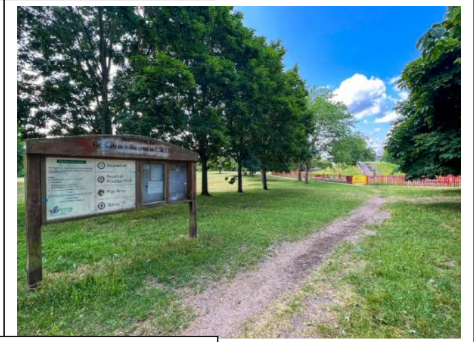
Easy reach of Grovelands recreational park with children's playground including outside basket ball court and tennis court