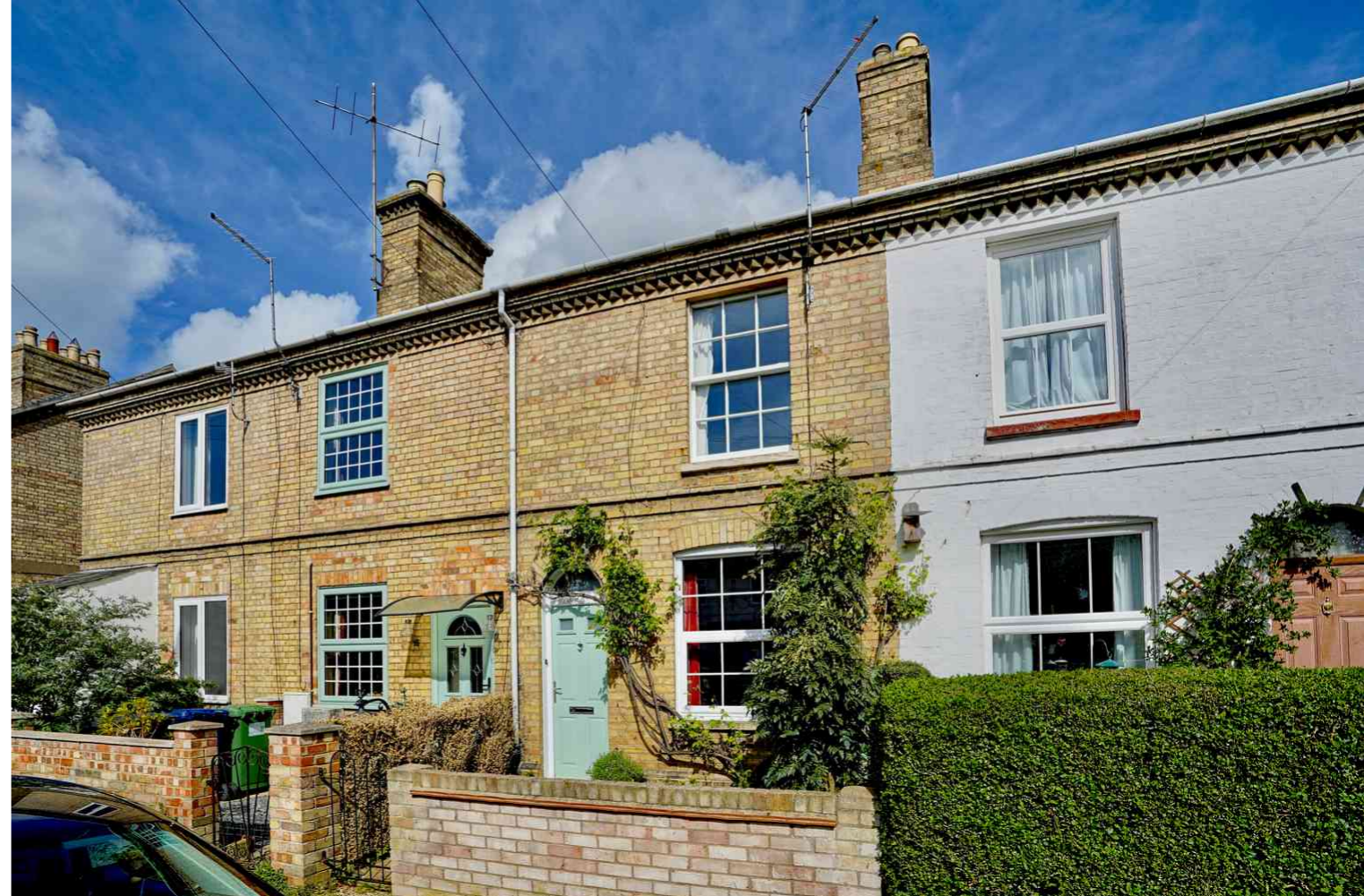
West Street, Huntingdon PE29 1WT