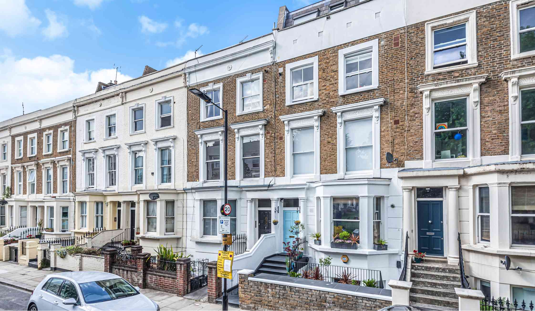
Edbrooke Road, London, W9 2DG