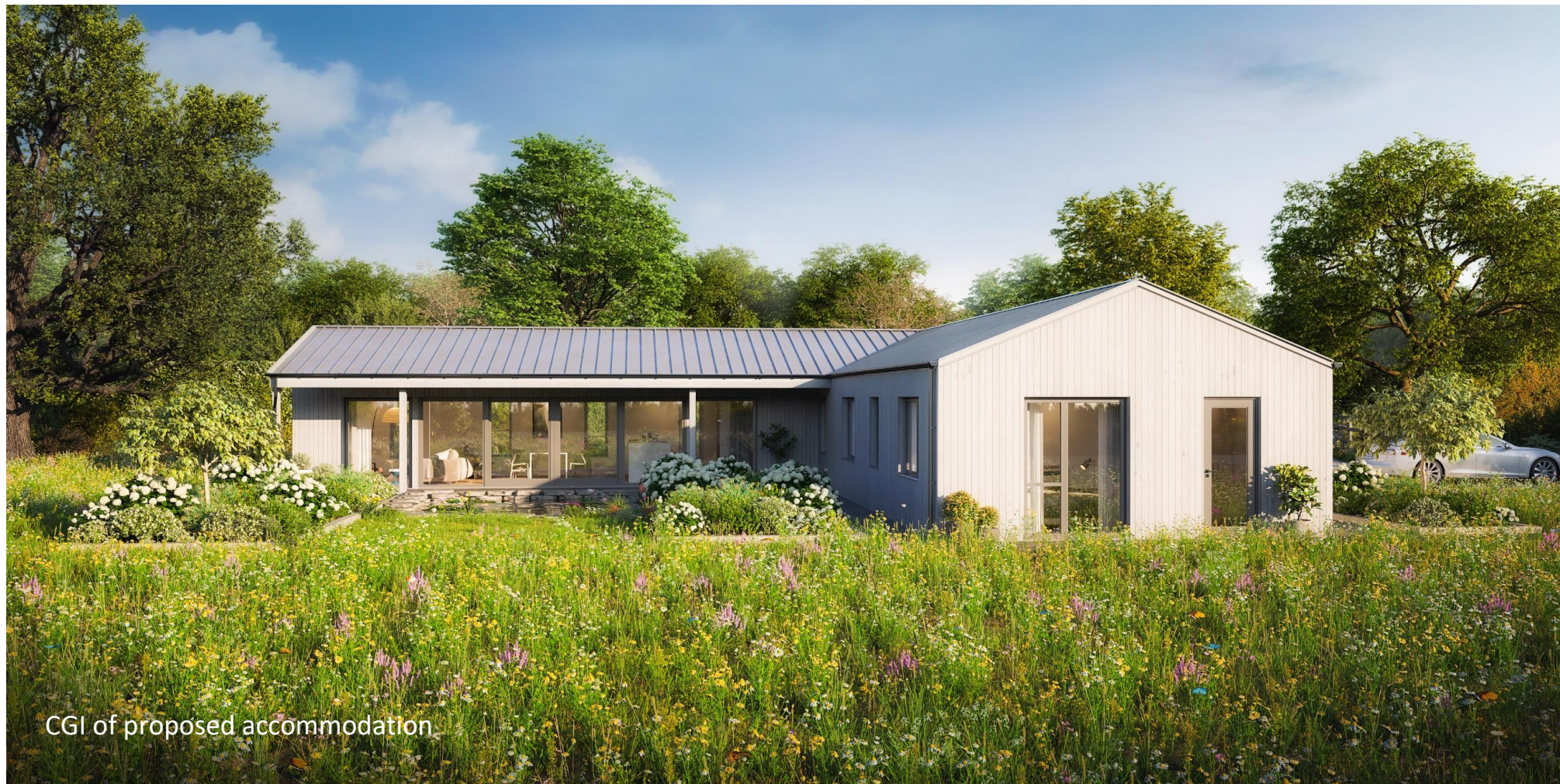
CGI of proposed accommodation