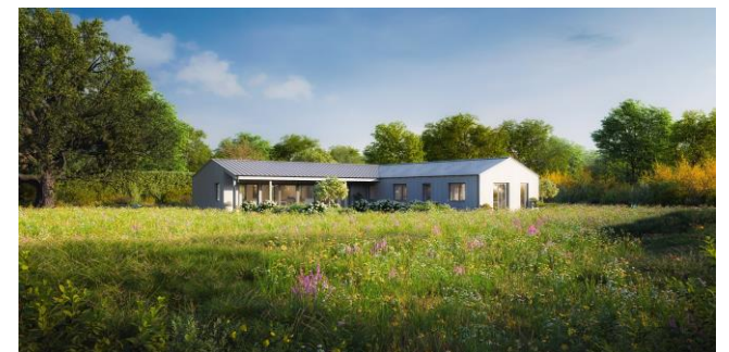
CGI image of the proposed accommodation