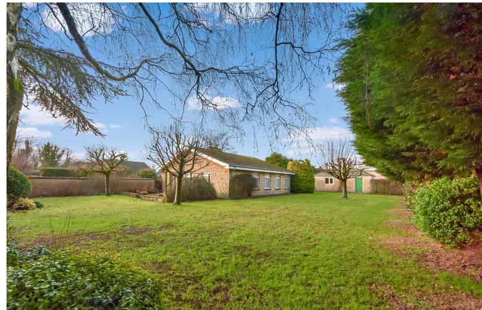
7 Kings Stile, Middleton Cheney, Banbury, Northamptonshire. OX17 2QZ Guide Price £650,000 - Freehold