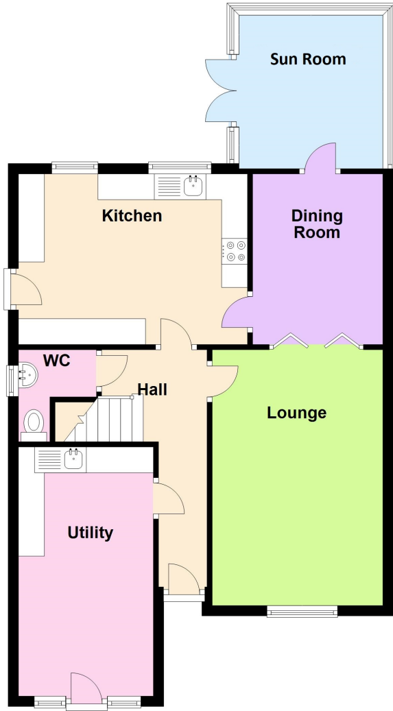
Ground Floor Approx. 71.6 sq. metres (770.8 sq. feet)