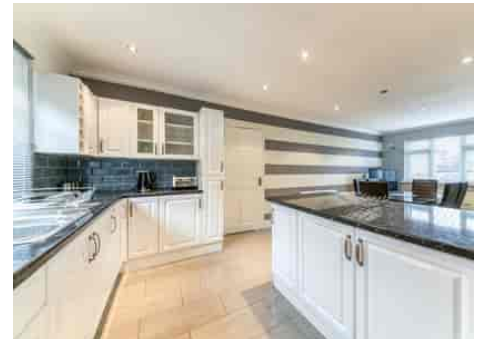
Bigginwood Road, London, SW16