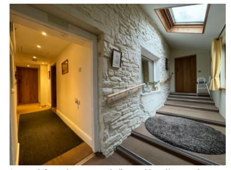
Accessed from the entrance hallway with radiator and access to: