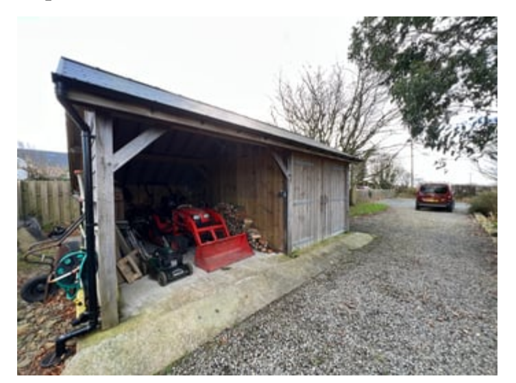
15' 0" x 10' 0" (4.57m x 3.05m) being open ended to front and useful log store and machinery storage area.