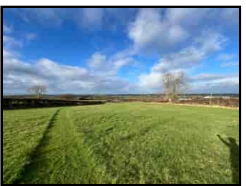
Bryngog, Nebo, Llanon, Ceredigion. SY23 5LN.