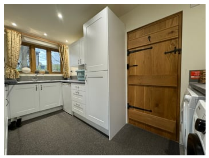
7' 4" x 13' 4" (2.24m x 4.06m) with a range of modern white base and wall units, stainless steel sink and drainer with mixer tap, side window, washing machine connection, external door to garden.