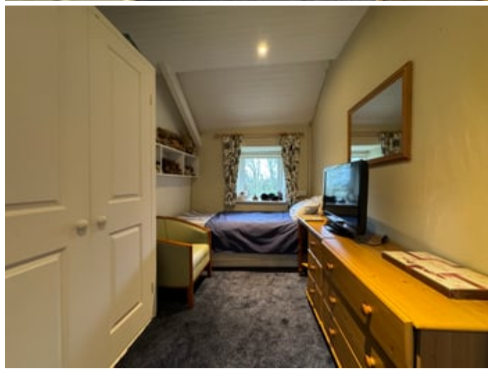
12' 4" x 7' 3" (3.76m x 2.21m) double bedroom, window to rear garden, fitted cupboards, multiple sockets.