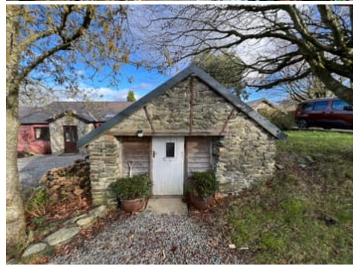
14' 8" x 10' 2" (4.47m x 3.10m) with planning permission for conversion as part of the dwelling of stone construction under box profile roof, concrete base, window to front, electric socket.