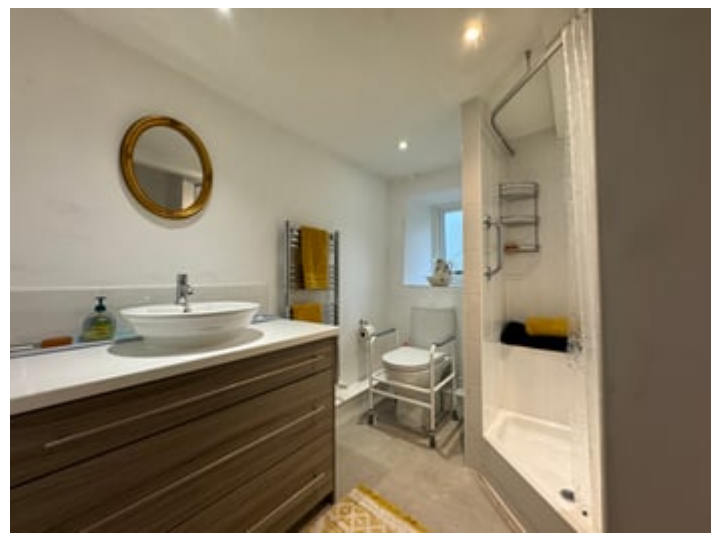
6' 6" x 8' 5" (1.98m x 2.57m) enclosed tiled shower unit, WC, heated towel rail, single wash hand basin on vanity unit, radiator.