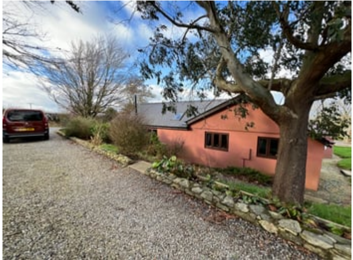
The property is approached via a private gravelled lane which serves a total of 3 properties with Bryngog being the last