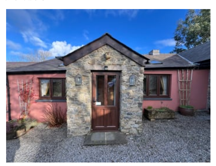
With glass panel door, slate flooring.