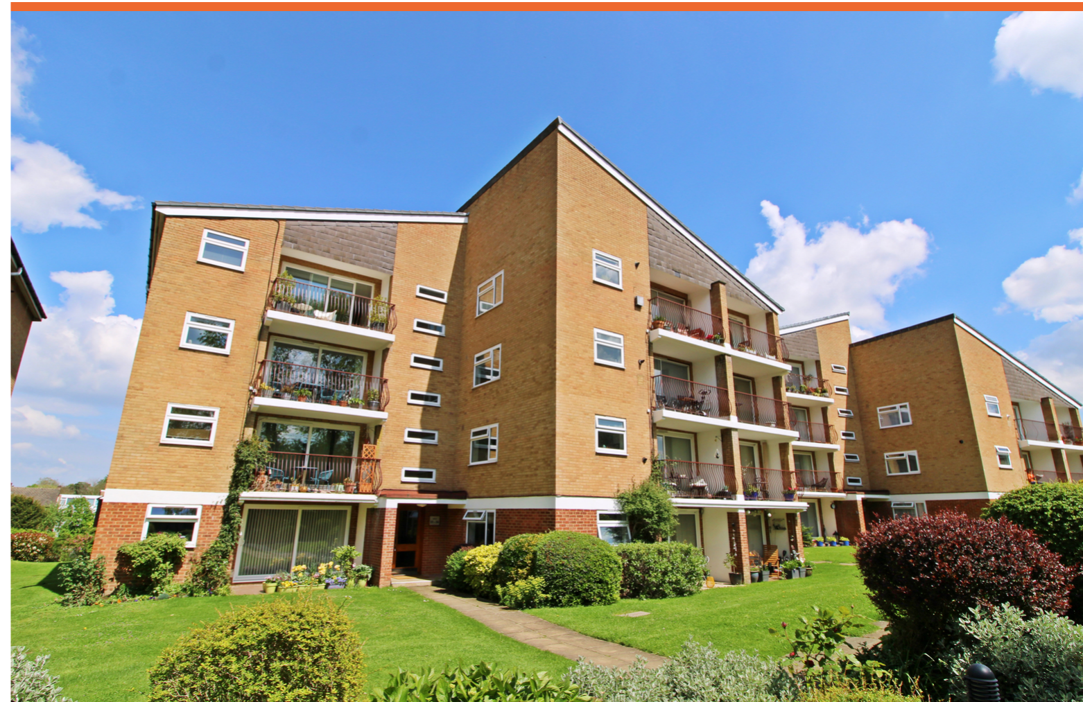
First Floor Flat 86.6 sq.m. (932 sq.ft.) approx.