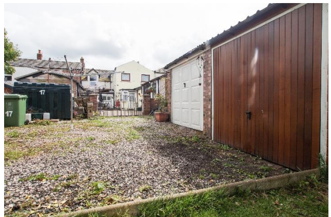
COURTYARD WITH OUTHUSES AND GARAGES