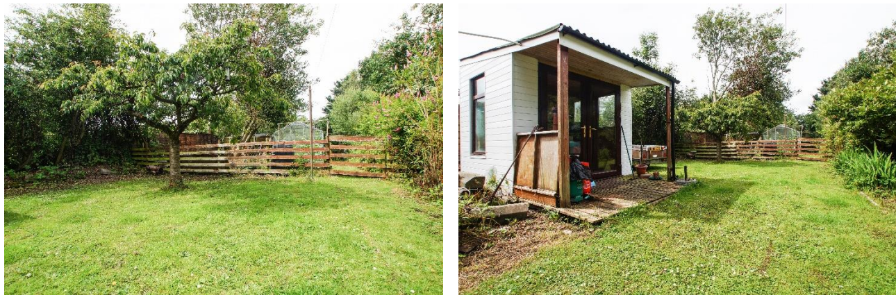
GARDEN AND SUN HOUSE

TENURE We are informed the tenure is Freehold