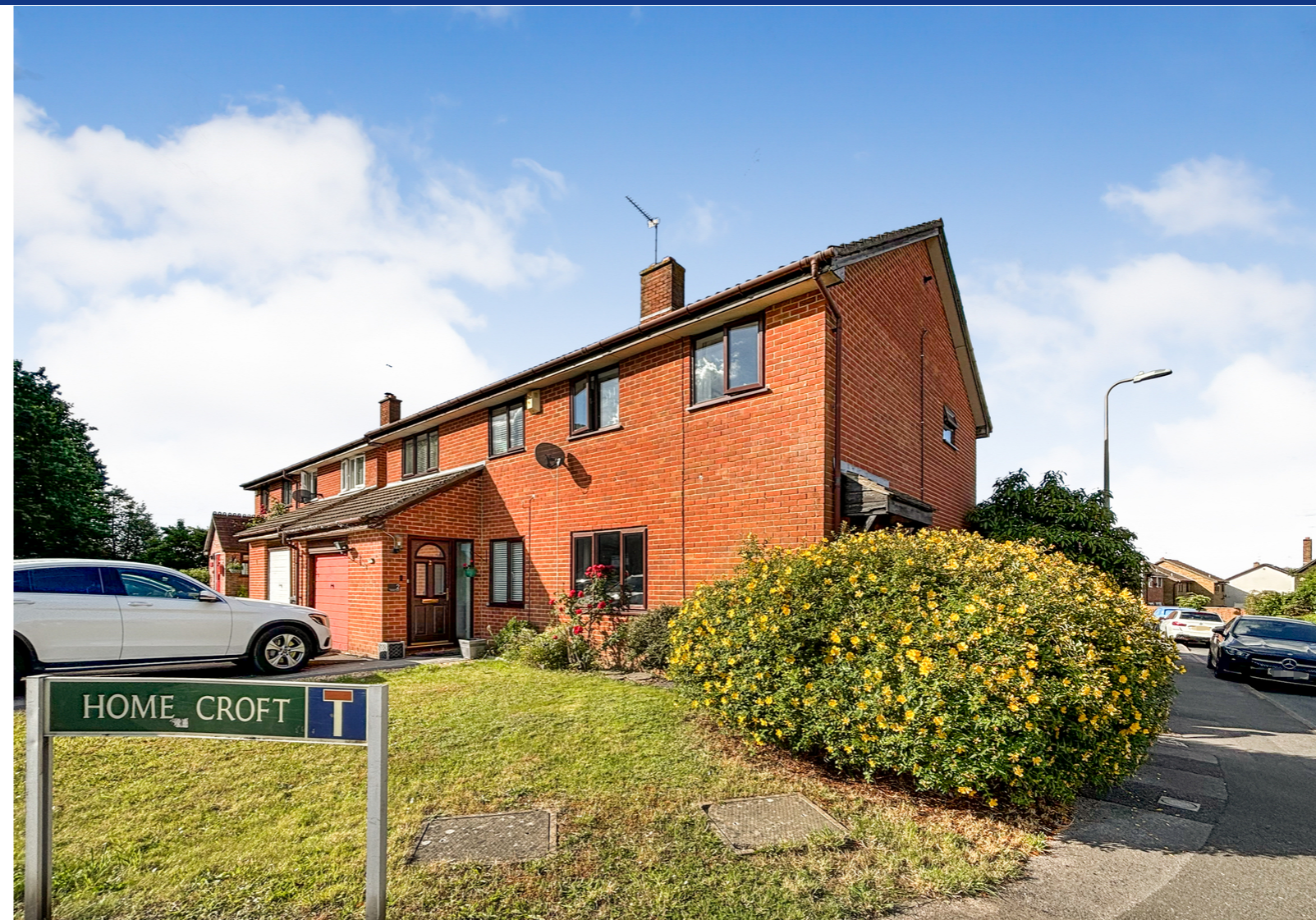
Home Croft, Tilehurst, Reading.