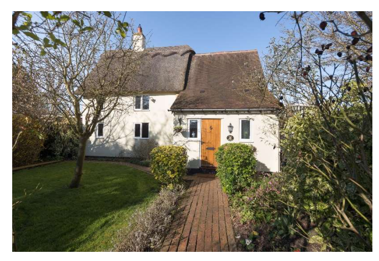
Rose Cottage Queens Road, Colmworth, Bedfordshire, MK44 2LA