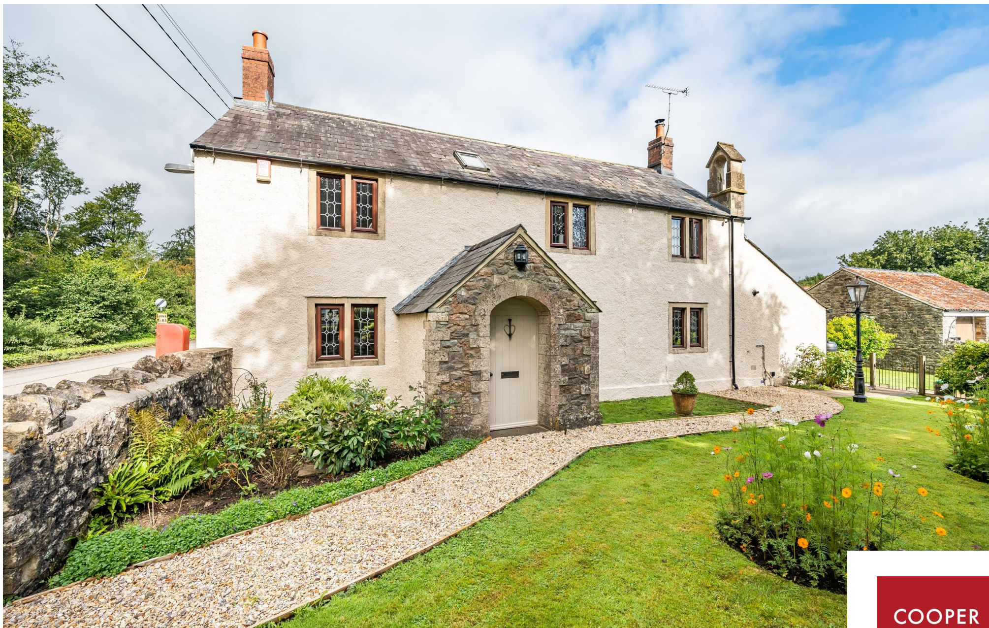
The Old Chapel, Green Ore, Nr Wells, BA5 3ES