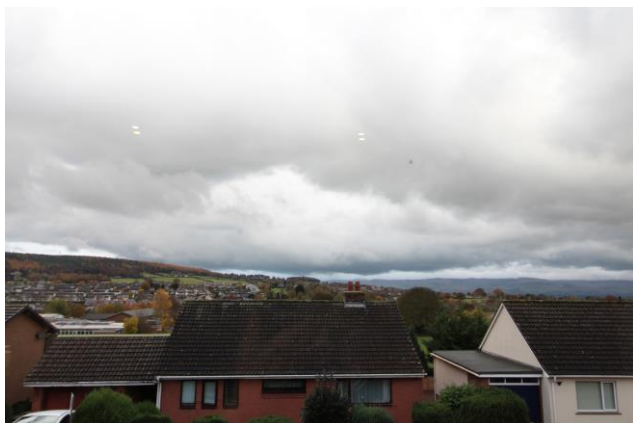
VIEW FROM BEDROOM 1

DIRECTIONS From the centre of Penrith, head out of Great Dockray on Castle Hill Road, which becomes Wetheriggs Lane. Turn right into Mayburgh Avenue and the left into Netherend Road, number 44 is on the right.