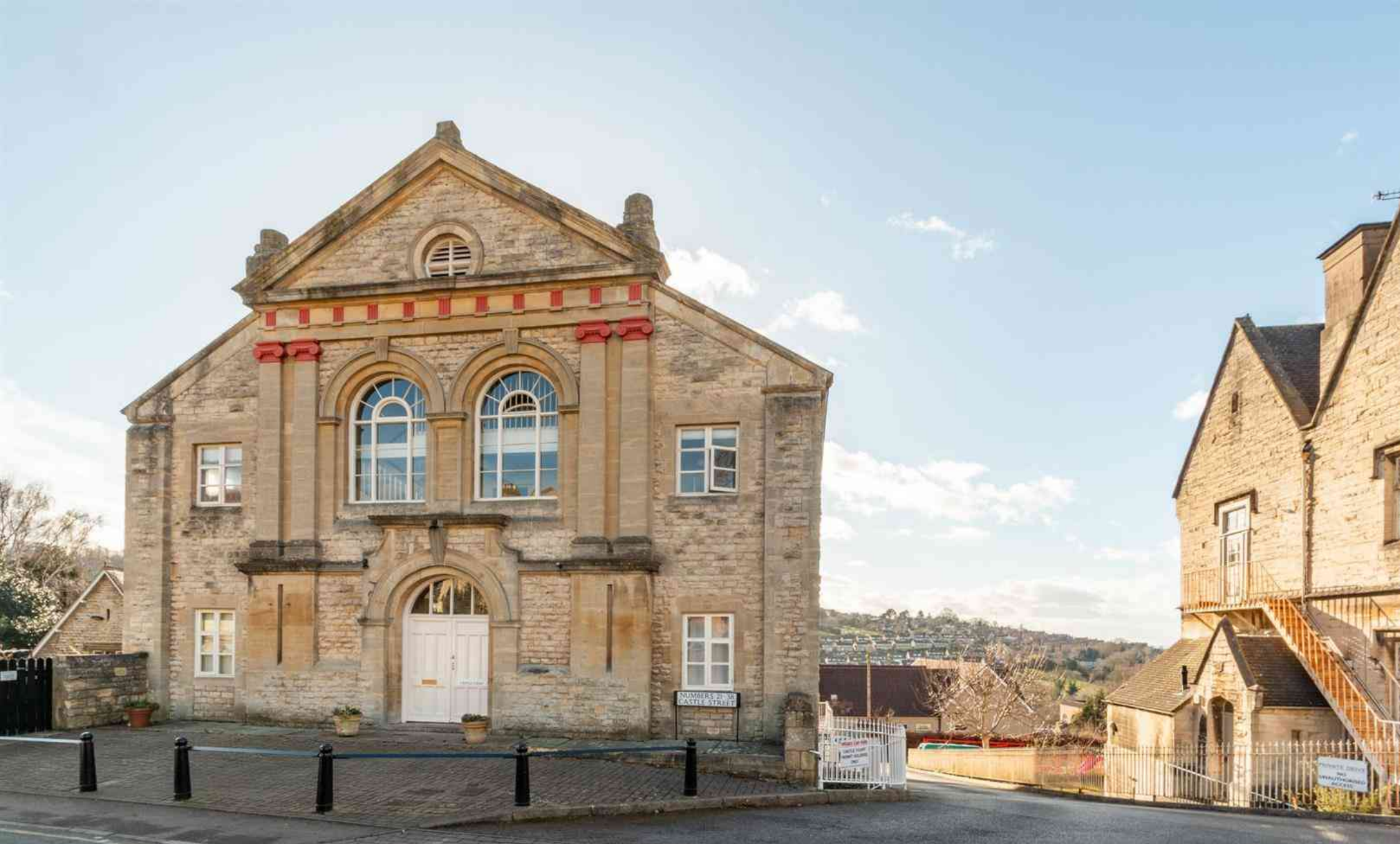
Flat 15 Castle Court, Castle Street, Stroud, Gloucestershire, GL5 2JD Offers Over £210,000