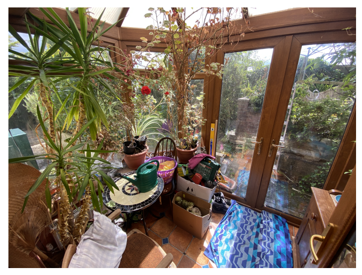
Of UPVC construction enjoying fantastic views over the garden.