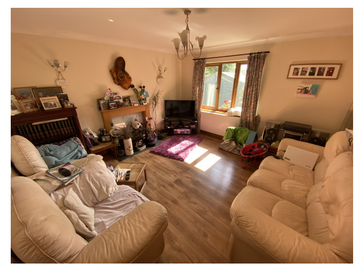
13' 0" x 13' 0" (3.96m x 3.96m). With ornamental fireplace, window to the rear, radiator.