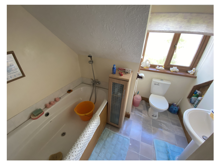
Having a 3 piece suite comprising of a panelled bath, low level flush w.c., wash hand basin, access to the loft space, radiator.