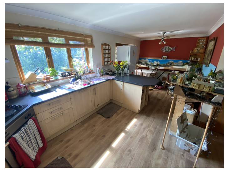
21' 0" x 13' 0" (6.40m x 3.96m). A modern 'L' shaped kitchen with a range of wall and floor units, 1 1/2 sink and drainer unit, electric hob and extractor hood over, double doors through to the Conservatory, radiator.