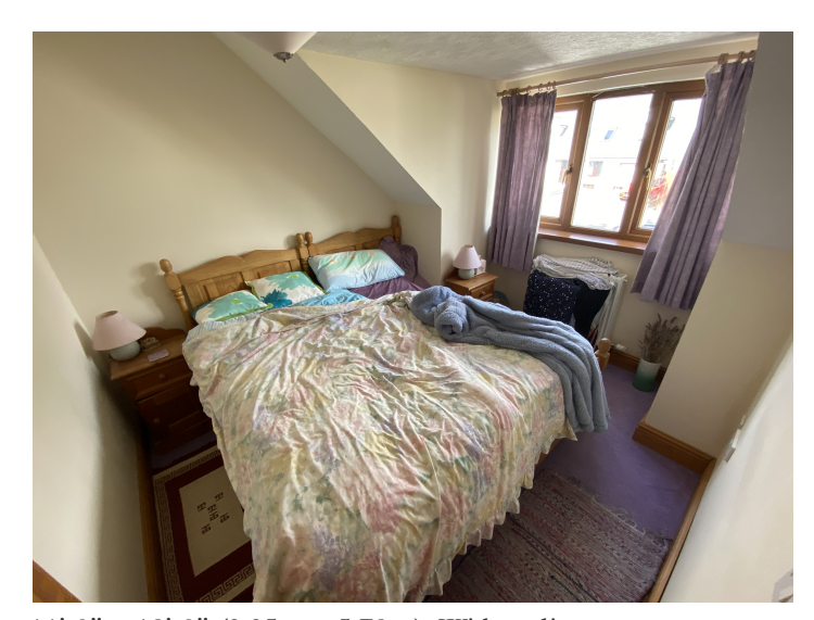
11' 0" x 19' 0" (3.35m x 5.79m). With radiator.