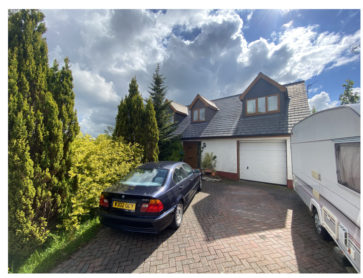
Block paver private parking to the front of the property.