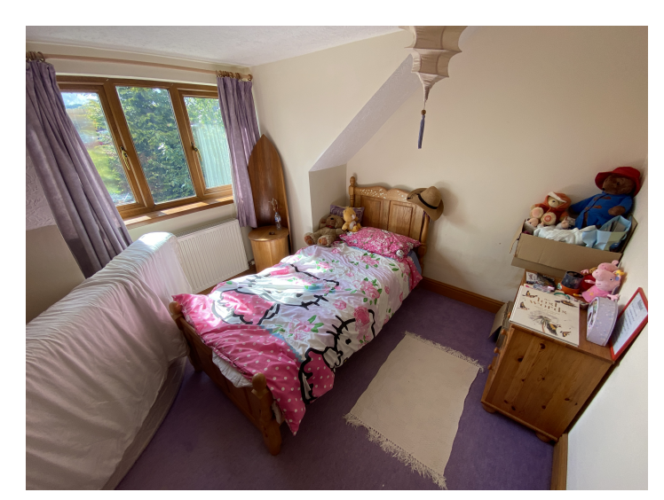
15' 0" x 10' 0" (4.57m x 3.05m). With radiator.