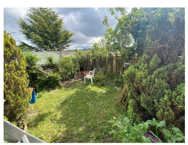
To the front and rear of the property lies a mature garden area, being laid to lawn with a good range of mature shrubs and trees providing great privacy, whilst also having a small terrace/BBQ area along with a patio.