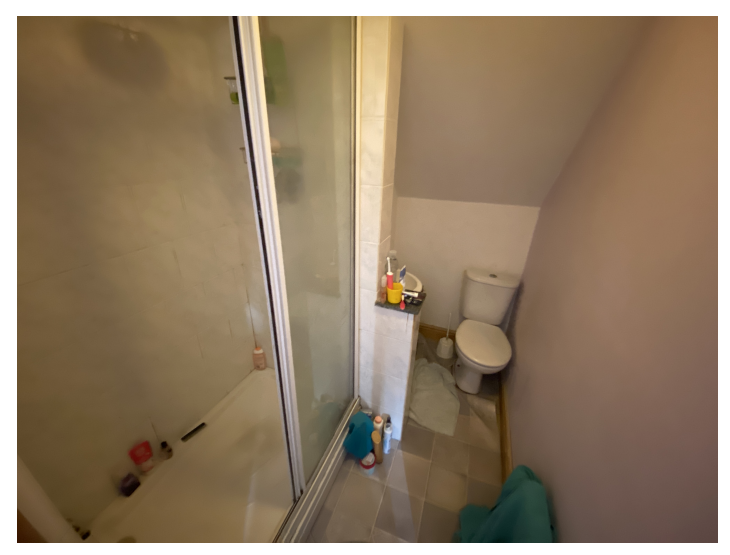
With double shower, wash hand basin, low level flush w.c.