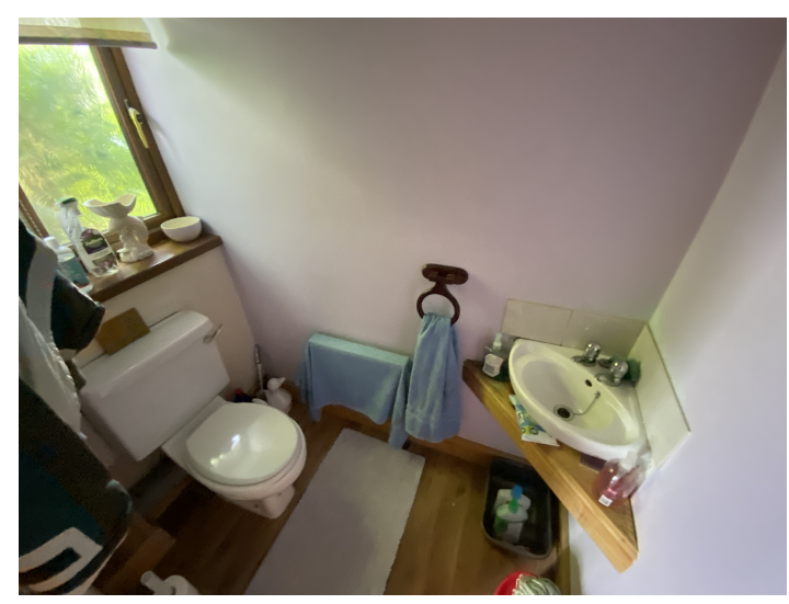
With low level flush w.c., wash hand basin.