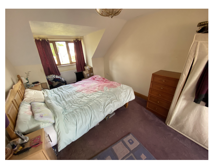
19' 0" x 15' 0" (5.79m x 4.57m). With dormer window to the front, built-in wardrobes.