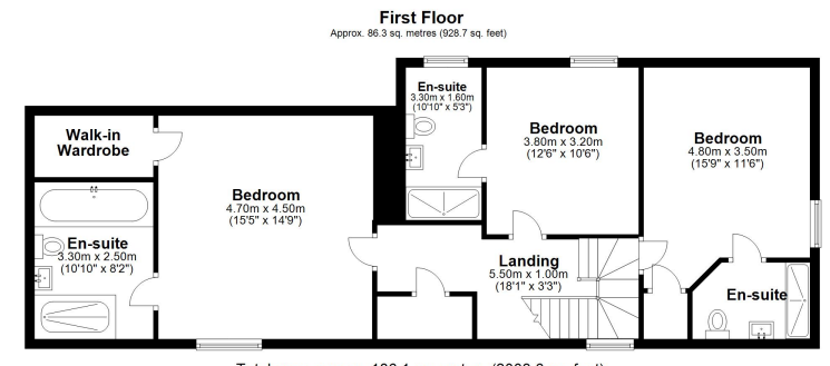
Total area: approx. 186.1 sq. metres (2003.6 sq. feet) NOTE: plans are full illustration purposes only and are not to scale Plan produced using PlanUp. Fernhill Lodge