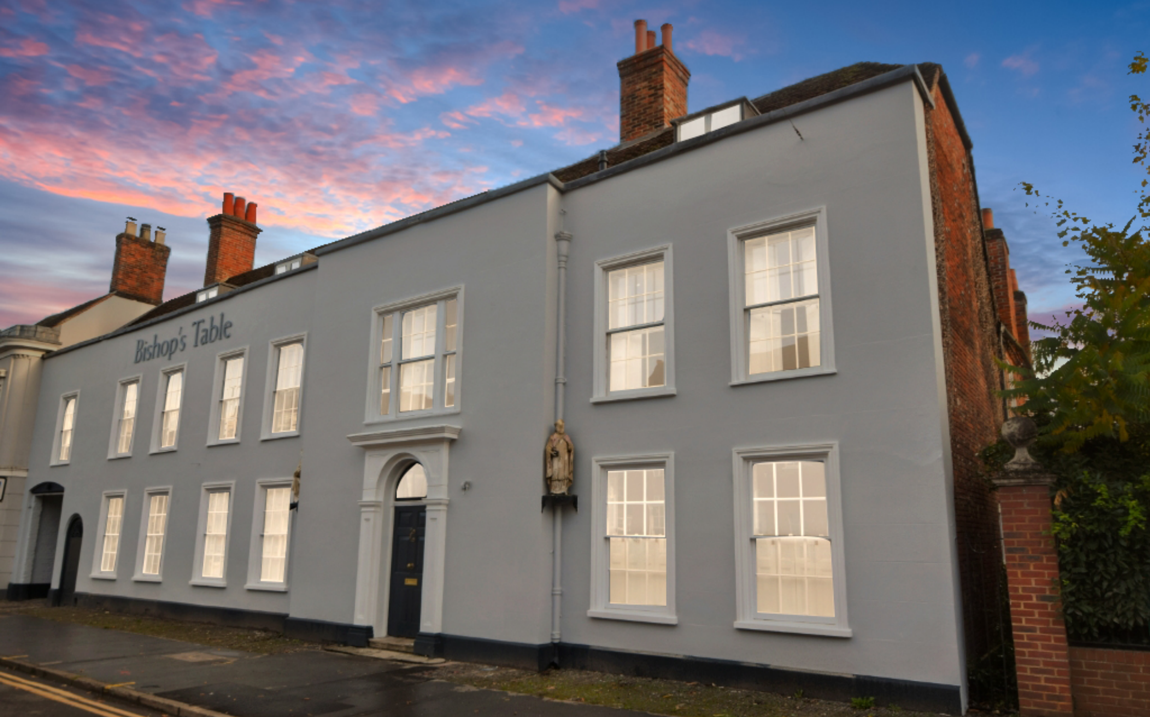
5 Bishops Table, West Street, Farnham, Surrey. GU9 7DR. Guide Price £499,995