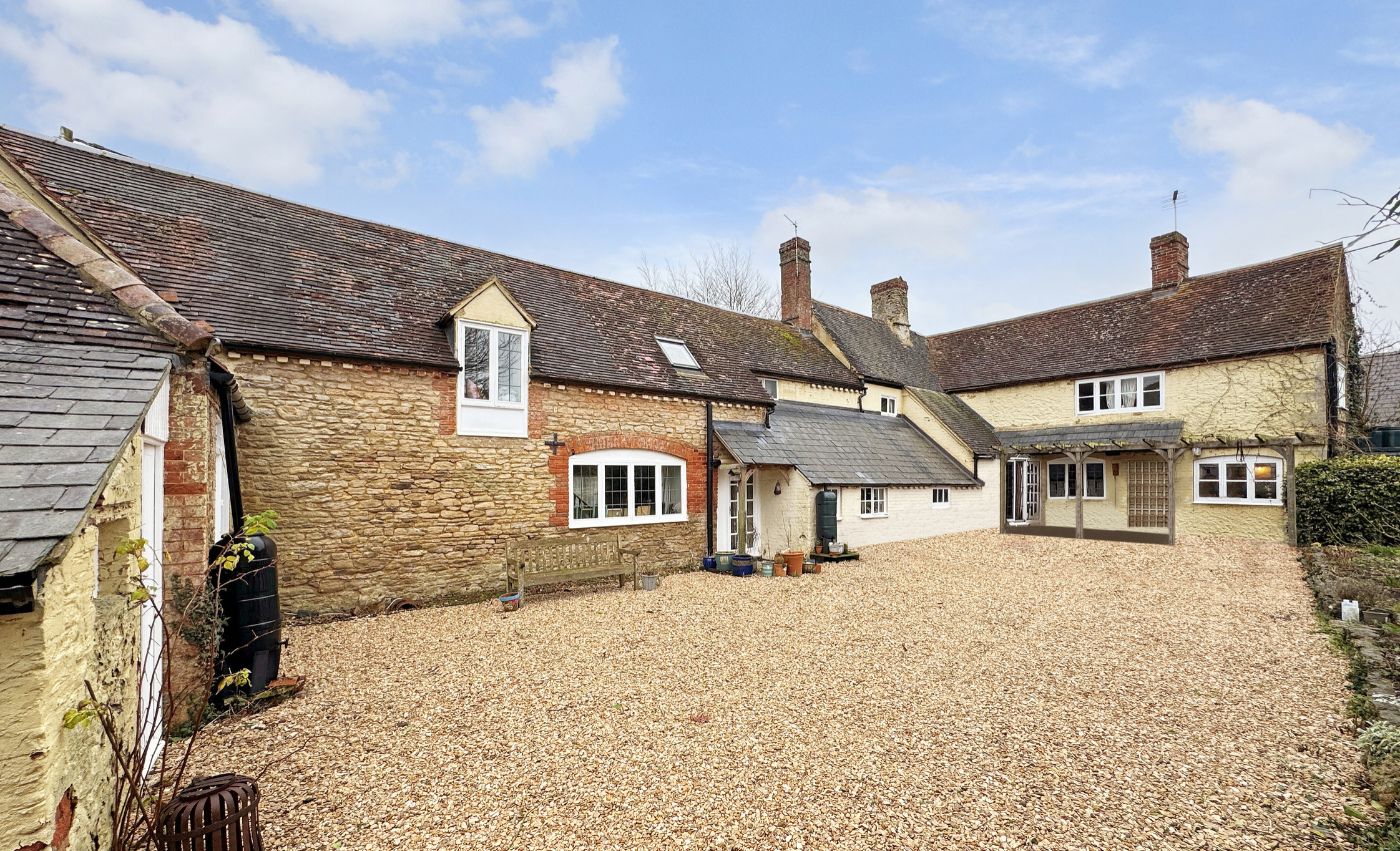
The Old Bakery, Main Road, Fyfield, Abingdon, Oxfordshire OX13 5LN Oxfordshire, £1,250,000