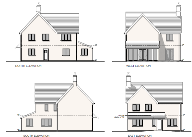
Plot 2 Proposed Elevation