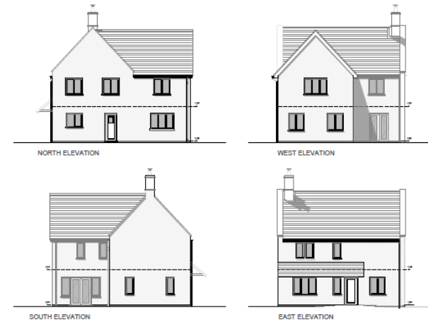
Plot 1 Proposed Elevation