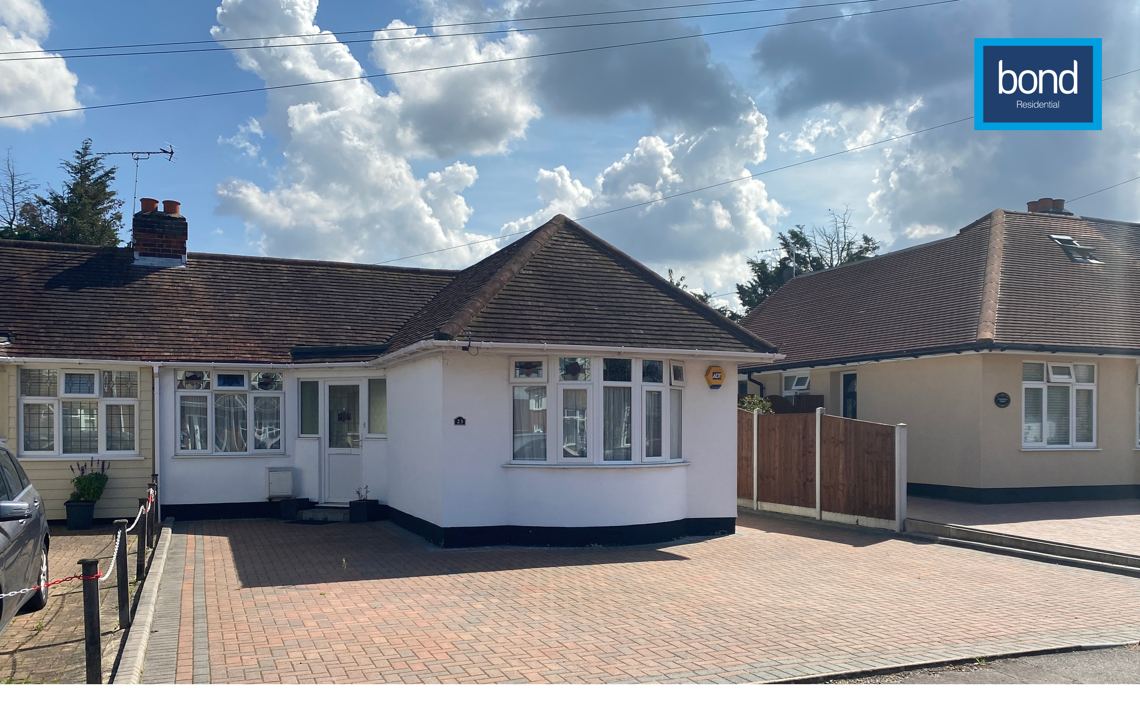
23 Baddow Hall Crescent, Great Baddow, Chelmsford, Essex, CM2 7BY