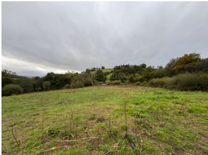
MATURE PADDOCK (SECOND IMAGE)

The property sits within its own land of approximately 2.35 acres and enjoys a mature paddock having roadside frontage, mature hedging and good gated access point. Ideal for those wishing to keep Animals with the recently built outbuilding offering housing. The paddock also enjoys a delightful stream boundary.