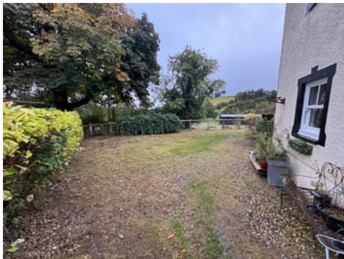
GARDEN (SECOND IMAGE)

To the rear of the property lies a formal garden area being enclosed and Dog proof and enjoying views over the paddock.