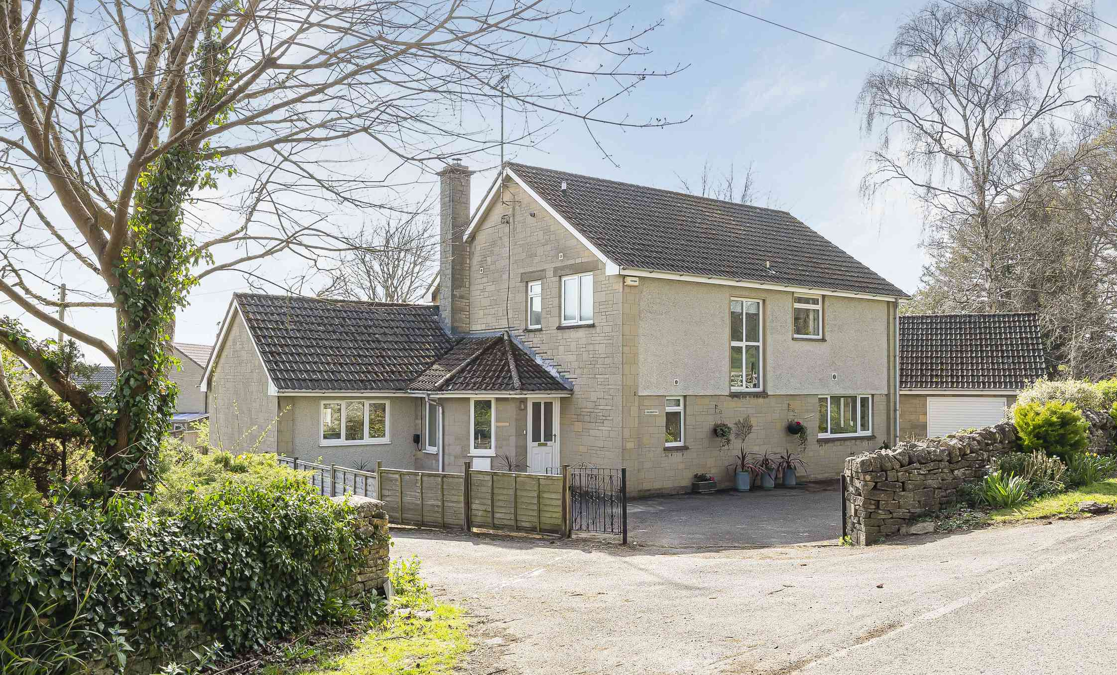
The Vicarage, Brantwood Road, Chalford Hill, Gloucestershire, GL6 8BS £785,000