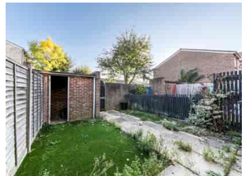
Chart Close, Croydon, Surrey, CR0 7YF