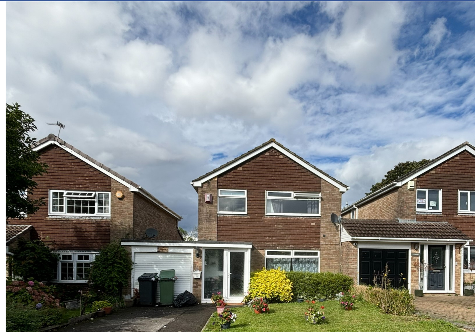
Gannet Close, Basingstoke, Hampshire. RG22 5QJ.