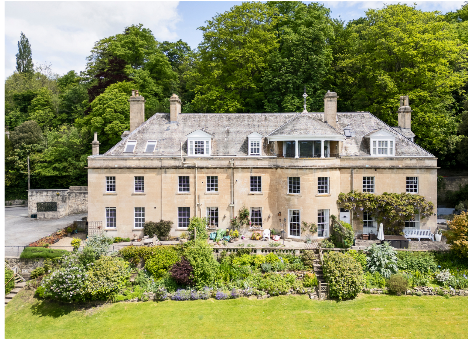
Bathwick Hill, Bath