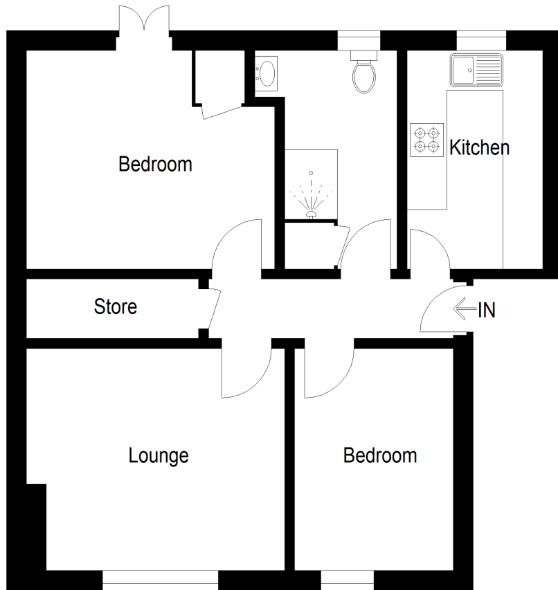
Illustration For Identification Purposes Only. Not To Scale (ID:1163322 / Ref:89905)