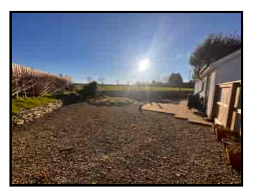
Hafan, 8 Cae'r Henwas Caerwedros, Nr New Quay, Ceredigion. SA44 6BE.