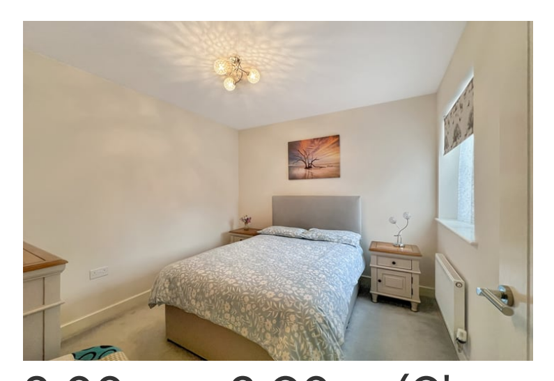
3.00m x 2.90m (9' 10" x 9' 6")