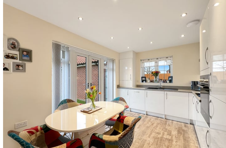
4.29m x 3.61m (14' 1" x 11' 10")