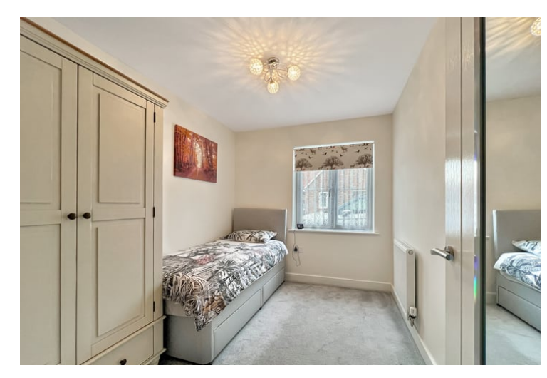
3.10m x 2.39m (10' 2" x 7' 10")