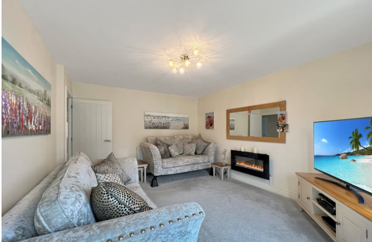
4.60m x 3.61m (15' 1" x 11' 10")