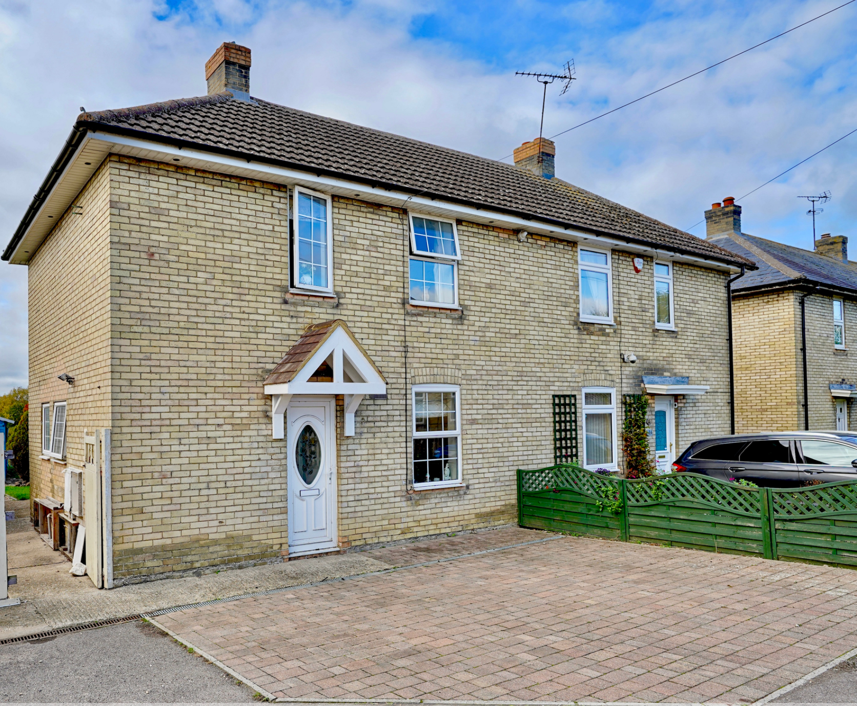
13 Montagu Gardens • Kimbolton • Huntingdon • Cambridgeshire • PE28 0JL