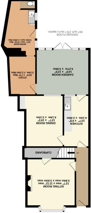
GROUND FLOOR 847 sq.ft. (78.7 sq.m.) approx.

TOTAL FLOOR AREA : 1399 sq.ft. (124.4 sq.m.) approx.