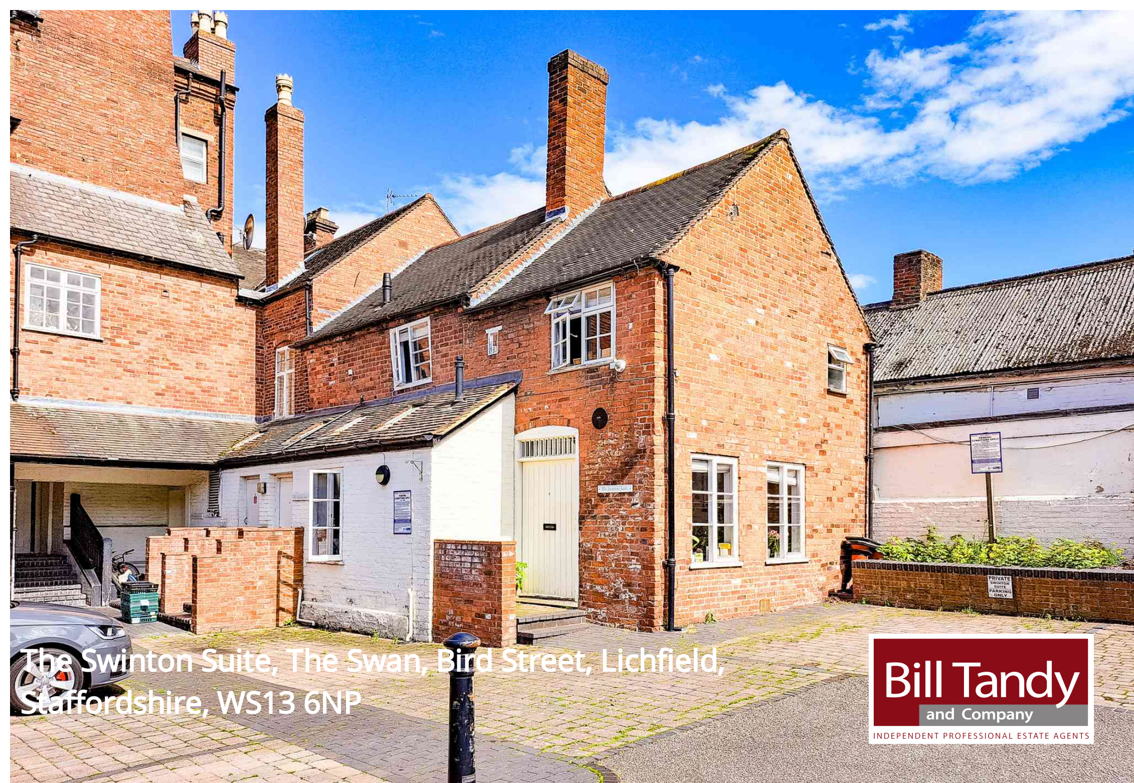
The Swinton Suite, The Swan, Bird Street, Lichfield, Staffordshire, WS13 6NP