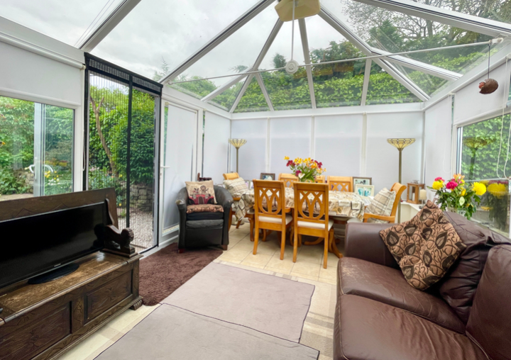
A charming detached cottage Two Bedrooms Wealth of character features throughout Private enclosed Gardens Double Garage and Off Road Parking