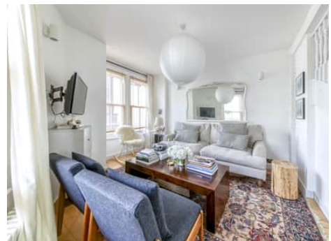
Jesmond Road, Croydon, Surrey, CR0 6JR